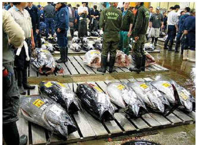
One 513 lb Bluefin sold for $177,000.