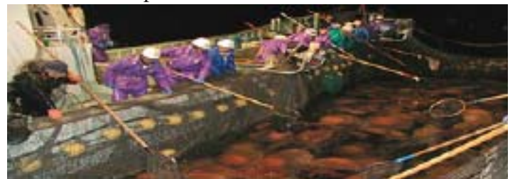
Fish Nets Filled to Breaking. No Fish; Just Jelly Fish. A 10 Ton Trawler Capsized

I used to predict the severe loss of the Pacific Leatherback turtles as a prime reason