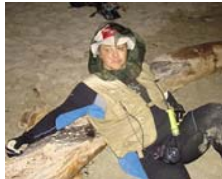
Where's my Leatherback??

Contact Liz with your comments and suggestions on our News Letter activities. travel@followliz.com